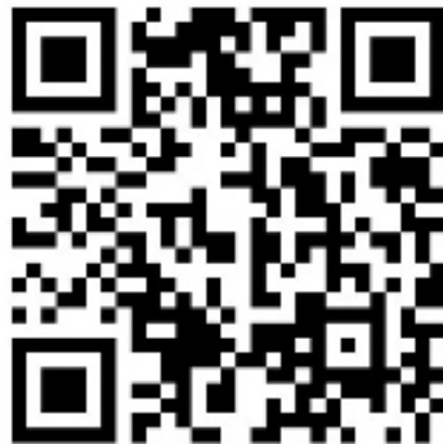
Time & Gifts Survey

Thank you to all who took the time to complete a Time & Gifts Survey! If you weren't able to, you can still complete one through the Zion webpage: https://zionhc.org/time-gifts-survey/ or scan the QR code here. If you need a paper copy, there are extras in the back of the sanctuary.